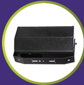
RF H6B, RF H10B