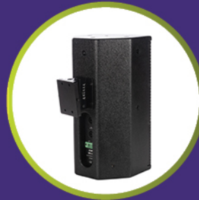
RF UB, RF UB55