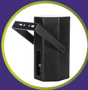
RF V6B, RF V10B