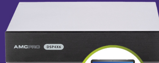
DSP4x6 Control software for Windows OS