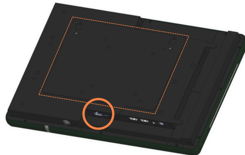
Detachable rear plate & LAN port.

Additionally, the TS-MT-10 by Netvio enables convenient countertop use, while the rear panel design ensures compatibility with a wide range of 100mm pitch display mounts.