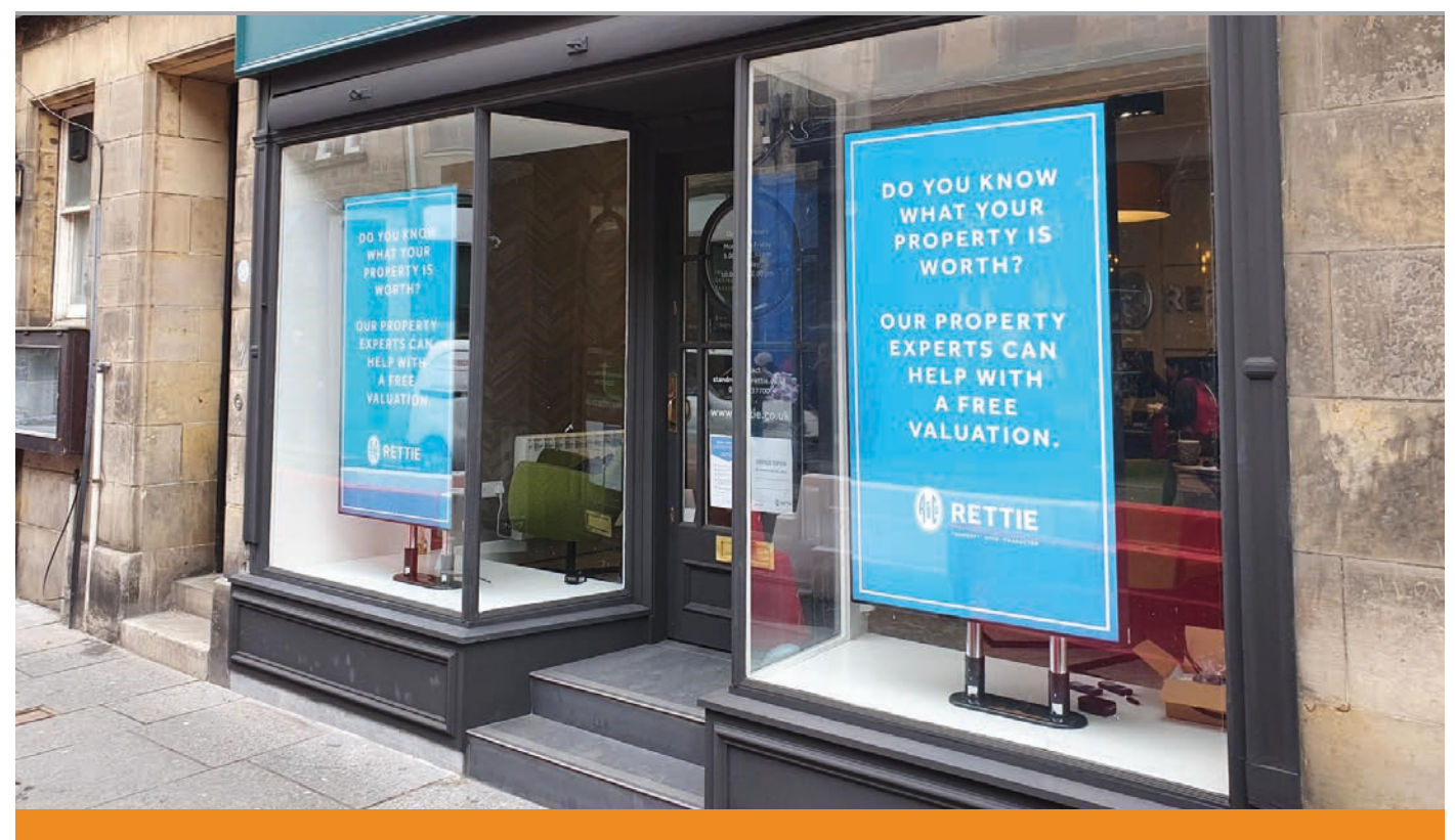
Designed for outward-facing window displays in direct sunlight